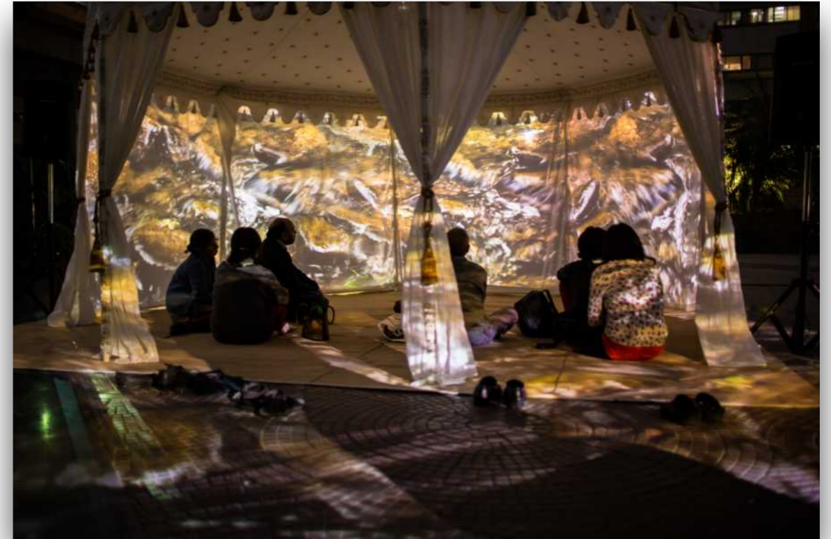
Five Rivers: A Portrait of Partition